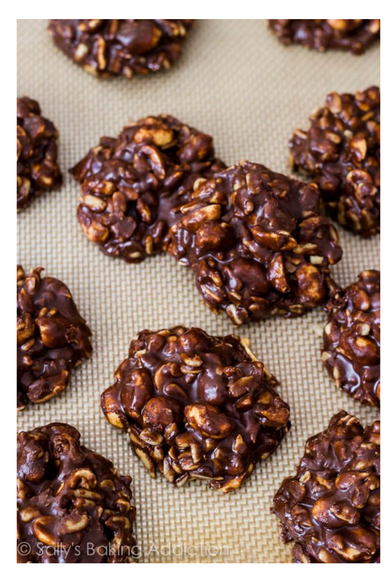
Gluten Free Recipes Desse